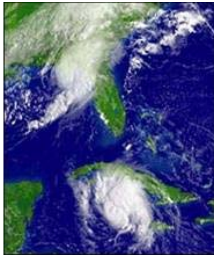
Satellite Photo of Hurricane Charley following Tropical Storm Bonnie

Principal Office 1900 Market Street Philadelphia, PA 19103 (215) 665-2000 (800) 523-2900 Fax: (215) 665-2013